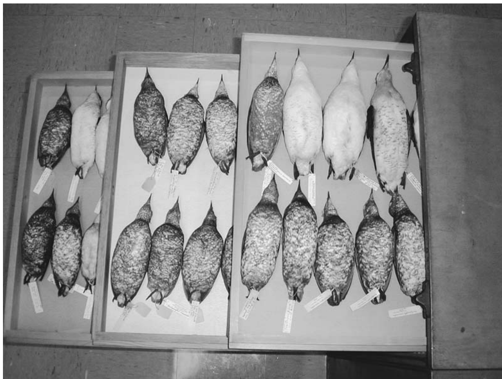
PLATE 1. Marbled Murrelets ( Brachyramphus marmoratus ) in the Museum of Vertebrate Zoology collected about 100 years ago.

only one egg (Fig. 1A). Both historic ratios and comparative analysis suggest that conserving murrelets will require restoring reproductive performance to yield juvenile ratios of 0.2–0.3 (Fig. 1), a measurable benchmark for evaluating recovery. Environmental changes responsible for a decline in murrelet birth rates include increased nest predation by an expanding corvid population (Nelson and Hamer 1995, Peery et al. 2004) and diminished prey resources due to overfishing and climate change that have caused a decline in the trophic level of Marbled Murrelets feeding in California Current System (Becker and Beissinger 2006). Although annual variation in food appears to have less impact on adult survival than do other sources of mortality (Peery et al. 2006b), Becker and Beissinger (2006) suggested that reduced food resources may greatly affect egg production, which appears energetically costly to murrelets, because they lay a single egg weighing ~25% of their pre-breeding body mass. A large percentage (50–90%) of murrelets now forgo breeding annually in central California and may do so because they cannot find sufficient food resources (Peery et al. 2004). Life history theory suggests that long-lived seabirds like murrelets should reduce breeding efforts during years of low food availability rather than increase their chance of starvation (Stearns 1992). Factors such as logging of nesting habitat and mortality from gill nets and oil spills, which